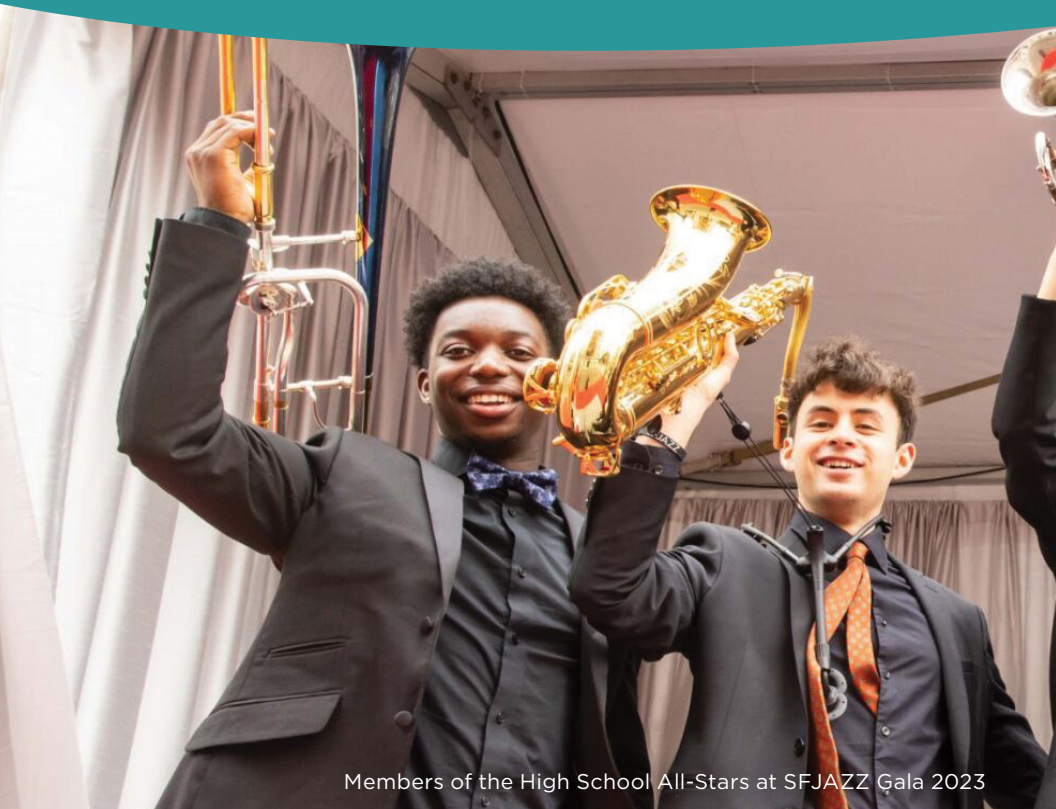
Members of the High School All-Stars at SFJAZZ Gala 2023

T he SFJAZZ High School All-Stars display a technical brilliance and musical maturity rarely seen in the youth ensemble arena. Don't miss the All-Stars in concert and support the next generation of jazz ambassadors!