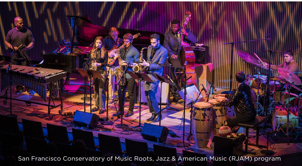
San Francisco Conservatory of Music Roots, Jazz & American Music (RJAM) program