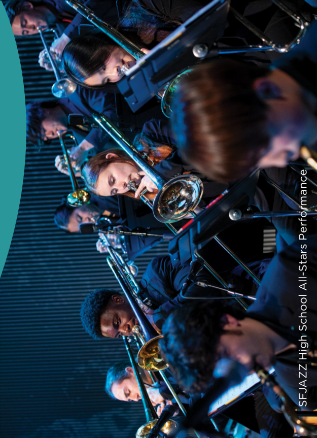
SFJAZZ High School All-Stars Performance

San Francisco Jazz Organization • 201 Franklin Street, San Francisco, CA 94102 • SFJAZZ.org