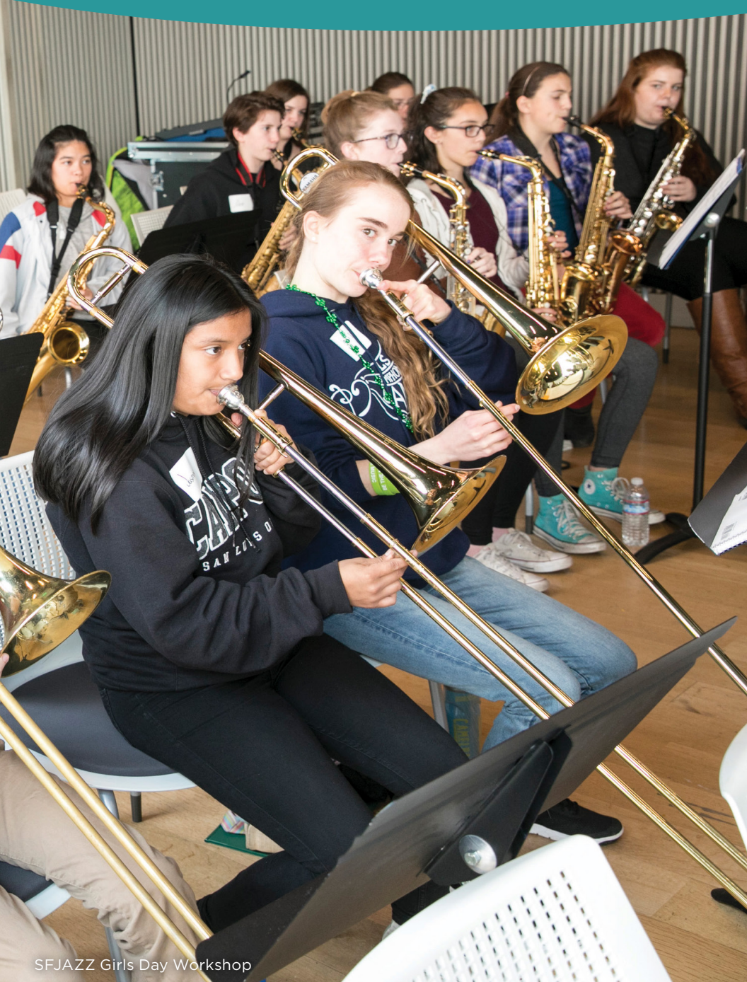
SFJAZZ Girls Day Workshop