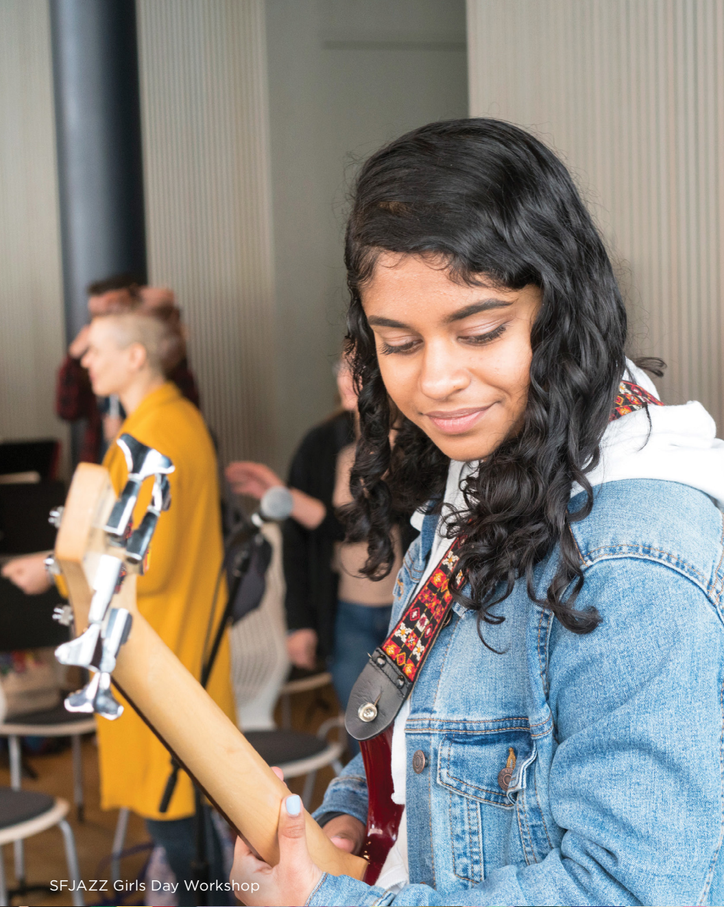
SFJAZZ Girls Day Workshop