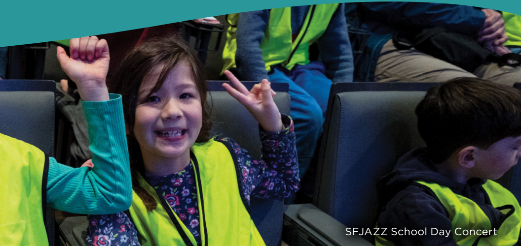
SFJAZZ School Day Concert